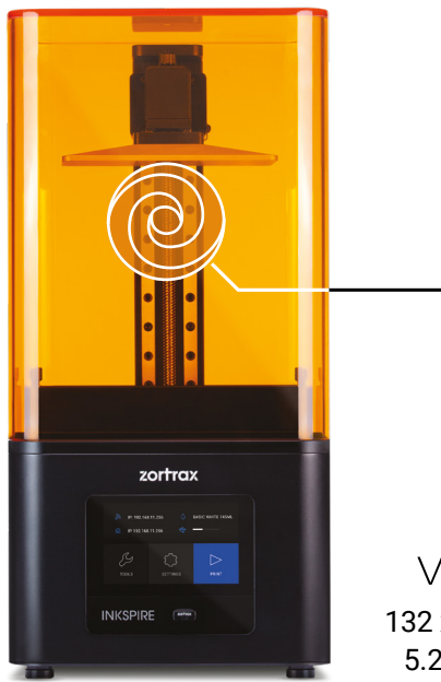
Build volume 132 x 74 x 175 mm 5.2 x 2.9 x 6.9 in