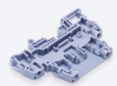
Fully functional contractor