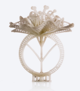
Jewelry investment casting pattern